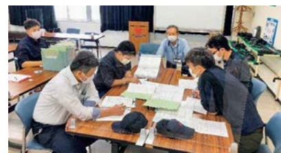
Internal environmental audits / Toyoda Gosei Hinode Co., Ltd.

sess whether our environmental management systems are run properly in accordance with ISO 14001. We are promoting 100% acquisition with the intention to have new companies acquire ISO 14001 certification within three years of being established.