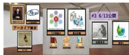
Environment Month (virtual environmental exhibition)