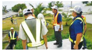
Toyoda Gosei (Thailand) Co., Ltd.

Voluntary annual inspections are performed based on TG Global EMS, which are our original environmental management system standards, problems are corrected, and kaizen activities are carried out.