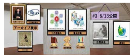
Environment Month (virtual environmental exhibition)