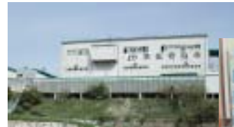
Head office of Togo Jushi

The WTG vice president in charge of engineering received an annual regional recognition award and was selected as an honorary president in 2003. In addition to all internal environmental programs, WTG was requested to become member of "Eastern townships Green committee". Buildings & Environment Mgr is the representative of WTG Inc. on this regional committee. The company's environmental programs implemented within the production facilities are shown to the authorities of all regions every year, so that they can understand how WTG is committed to preserving the environment.