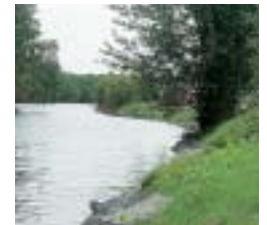
Recovered Coachcock River bank