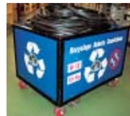
Recycling container for rubber waste