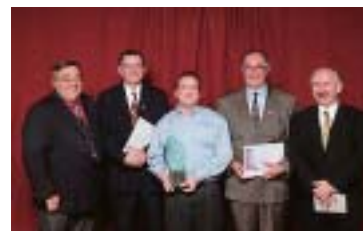
Award ceremony for the Environmental Prize in Eastern Township region