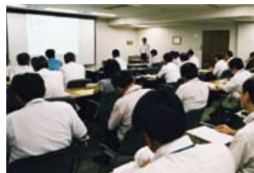
Internal Auditing Corporate Training Meet

Along with the creation of this system, we have implemented the 1st audit training for functional divisions and plan to step up this training from 2009 as well. Also, we prepared internal controls relating to financial reporting based on Financial Instruments and Exchange Law that went into effect in fiscal 2008, and submitted our "Internal Controls Report".