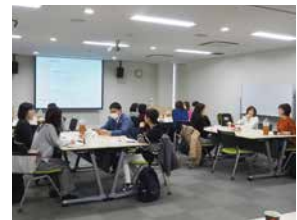
Working parent networking meeting (support for childcare-work balance)