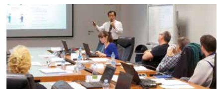
Overseas middle management training

development programs for all global employees.