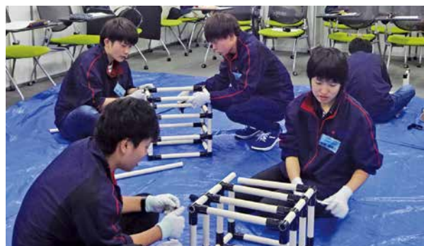
New employee training

With the aim of strengthening our production floors, the source of our competitiveness as a manufacturing company, we are enhancing technical education for employees of each level working at manufacturing sites and in each field of expertise. Technical education spanning four months was provided to 61 skilled workers who joined the company in April 2019. Following training in safety basics on the production floor (danger simulations) and basic manufacturing education including practical training in die maintenance, fabrication of two-legged walking robots, and disassembling and reassembling automobiles, they received practical training on a manufacturing shop floor for three months.