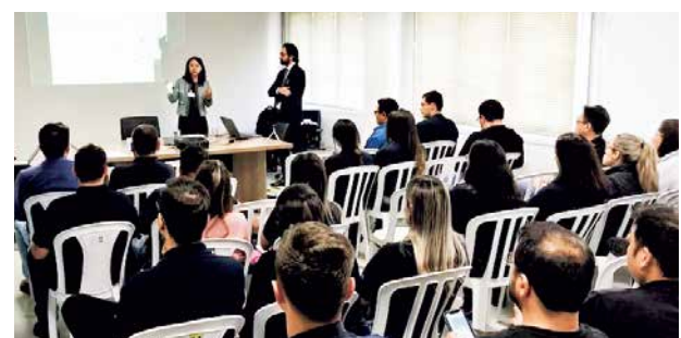
Compliance training (international Group company)

Toyoda Gosei has formulated Global Anti-Bribery Guidelines as a common guide to conducting transparent and sound business activities globally, and is doing its utmost to prevent bribery and corruption at all Toyoda Gosei Group companies. Education activities are continuously conducted for employees through training for each level and risk.