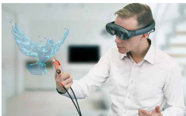
e-Rubber haptics and augmented reality

We have also been working to pioneer new businesses. In January 2020, we showed the world our e-Rubber technology at CES, the world's largest electronics exhibition held in Las Vegas, USA. e-Rubber is a novel material that can virtually reproduce the sense of touch. In the coming years we intend to bring products to the market in the three areas of IoT sensors, haptics, and tactile hands. We also plan to move ahead with activities for commercialization in many fields, with a view to possibilities that will meet social needs in areas such as telemedicine.