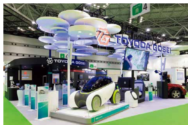
Toyoda Gosei booth at Tokyo Motor Show 2019

Improving our business in Europe has been a major issue for years, and we have reformed our business structure by selling Toyoda Gosei Meteor in Germany. In the fourth