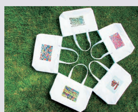
Printed with artist designs by Atelier Yamanami