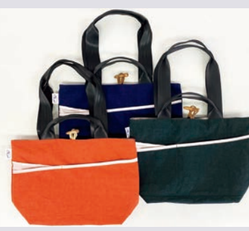
Colored tote bag using a seat belt for the handle (Products made in collaboration with Ashimori Industry Co., Ltd., with which we have a business tie-up)