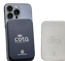
2023 Wireless power supply receiver for smartphones

Success in making larger GaN substrates for next-generation power semiconductors