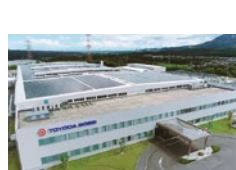
2020 Inabe Plant begins operation