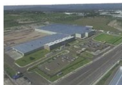
2014 Toyoda Gosei Irapuato Mexico, S.A. de C.V. is established