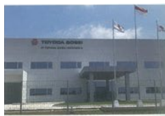
2018 PT Toyoda Gosei Indonesia is established