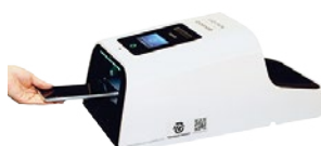
2021 UV-C LED high-speed surface disinfectors