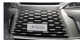
2023 Topcoat-less hot-stamped grilles