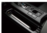
2023 Miniature wireless charging holder