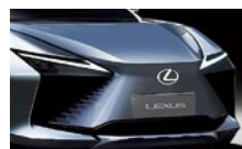
2023 Millimeter wave compatible emblem that emits light