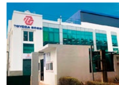
2023 Toyoda Gosei Technical Center India