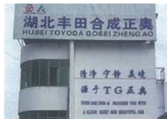
2019 Hubei Toyoda Gosei Zheng Ao Rubber And Plastic Sealing Technology Co., Ltd. is established