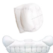
2021 Driver-side airbags for better protection in angled frontal collisions/Pedestrian protection airbags