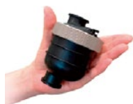
Compact UV-C LED water purification unit

Energy-saving LED technology is used to also contribute to hygiene by disinfecting air and surfaces and purifying water