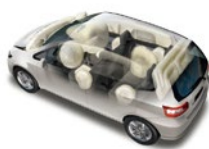
Safety system products (such as airbags, etc.)

Energy-saving LED technology is used to also contribute to hygiene by disinfecting air and surfaces and purifying water