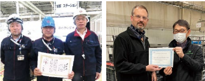
On-site confirmation meeting by the president and vice president (Left: Japan, Right: North America)

We have obtained ISO 9001/IATF 16949 certification for our quality assurance system and have established a quality management system. We are also building quality into new products using an Initial Management System that checks the degree of completion of each process from planning to design to production. We are