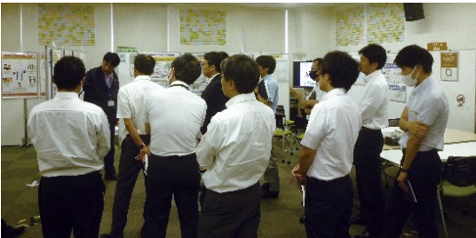
Learning activities at the Quality Learning Center

In response to the Global Safety, Fire Prevention, and Quality Declaration issued by the president, all employees make a Declaration of Thought and Action based on their roles and responsibilities. During initiatives like Global Quality Month, employees reflect on their actions while prioritizing Customer First and Quality First. As part of this effort, we have established the Quality Learning Center to provide a space for learning and cultivating a quality-oriented mindset.