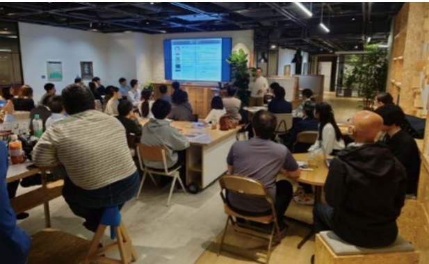
External exchange activities as part of the Value Creation Community

In response to the Global Safety, Fire Prevention, and Quality Declaration issued by the president, all employees make a Declaration of Thought and Action based on their roles and responsibilities. During initiatives like Global Quality Month, employees reflect on their actions while prioritizing Customer First and Quality First. As part of this effort, we have established the Quality Learning Center to provide a space for learning and cultivating a quality-oriented mindset.