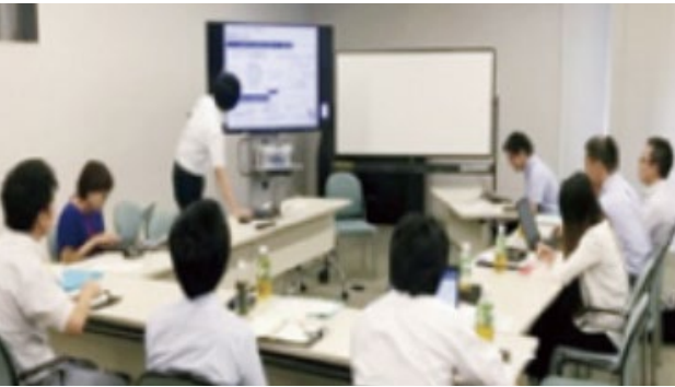
Practical data science workshop

*4 University professors and experts from the Toyota Group serve as instructors